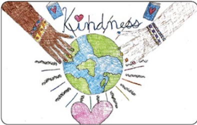
Finalist: Abigail Mullen

that might appeal to kids. So I created the design to remind children of all ages, that the library is for everyone, kindness can be as simple as helping each other return library books and everyone deserves space to enjoy a good story...even cats and dogs!"