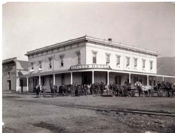
Northeast corner of Shattuck and University, 1892

http://berkeleypubliclibrary.org/system/histrm.html