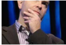
January 24: Berkeleyside's first Local Business Forum