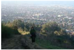
Tips to get fit in 2011 from a health and wellness coach