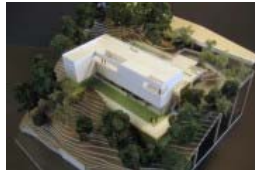
Lotus founder may yet build his new Berkeley home